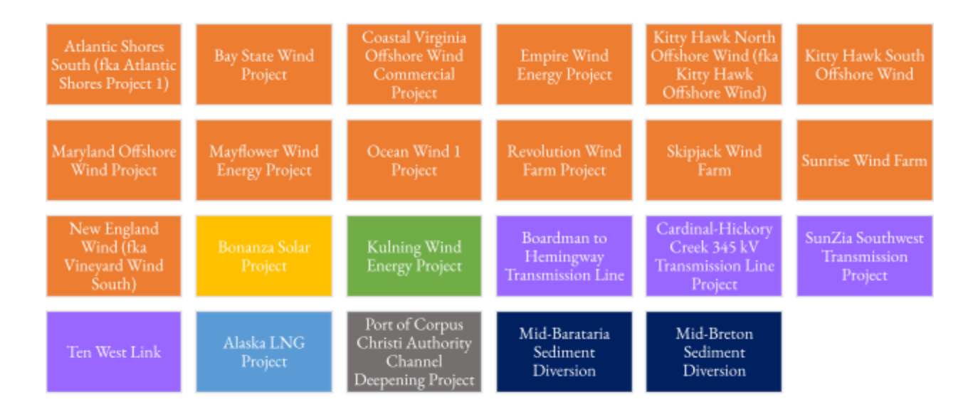
Figure 1: List of covered projects undergoing active Federal review in FYQ3 2022.